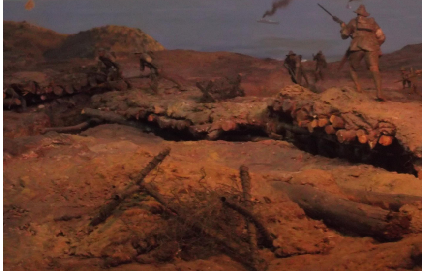
Image 10: A similar view from the left side of the diorama.

The aspect that chiefly guided construction of these features was the decision to have the Australians charging towards the viewer. Early guidelines stated that the model should depict “the men attacking the final objective.” 68 Taken literally, this would have been a scene of the 13 outposts that the Australians established deep inside the Turkish trench system at Lone Pine. To depict such a scene in the style of an “inset picture model” would have been impractical. The scene depicting the attack on the front trench was therefore the only viable option, as selecting an individual outpost would have eliminated one of the three characteristics of the model scheme – comprehensiveness. While the way the attack was shown was not strictly comprehensive, as it depicted only the three assaulting battalions, it was nonetheless better than focusing on an individual platoon. According to Pretty, it was Anderson who chose to take a point of view from behind the Turkish trench. 69 No exact reason could be found for the decision, however, some likely reasons can be examined. All the other dioramas showing Australians in attack have the viewer peering over the Australians’ shoulders. Such a perspective transforms the diorama’s objective – usually a terrain feature such as a pillbox or hill – into a critical aspect of the diorama and provides the viewers with the visual impression that Bean