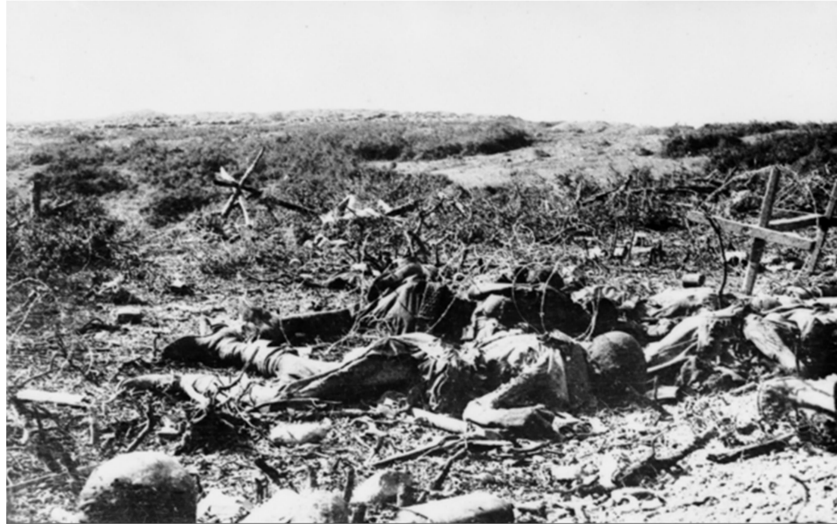
Image 8: A period photograph of the perpendicular-shaped barbed-wire obstacles set before the Turkish front line at Lone Pine. Anderson accurately replicated their dimensions.

This dialectic work ethic was also shown in Anderson's Turkish trench line and its defensive works, which were constructed in a way that provided viewers with a better image while altering a few historical details. Few photographs of the Turkish front line exist; however, the extant photographs provide some interesting points of comparison. One photograph taken during Bean's expedition to Gallipoli in February 1919 shows that, at least in some places, the Turks had created firing loopholes extending above ground level about waist high. These required the Australian soldiers to jump or climb over them in order to progress rearward. Had Anderson replicated this feature it would have obscured those figures closer to the Turkish front. To avoid this issue, Anderson raised the foreground and created an artificial depression immediately in front of the trench (yet in front of the infantry) so that the charging figures remained visible. In addition, the depression allowed him to replicate the trench construction by placing the firing loopholes further down into the ground. The figures could thus be shown approaching the trench without having their lower halves obscured to the viewer.