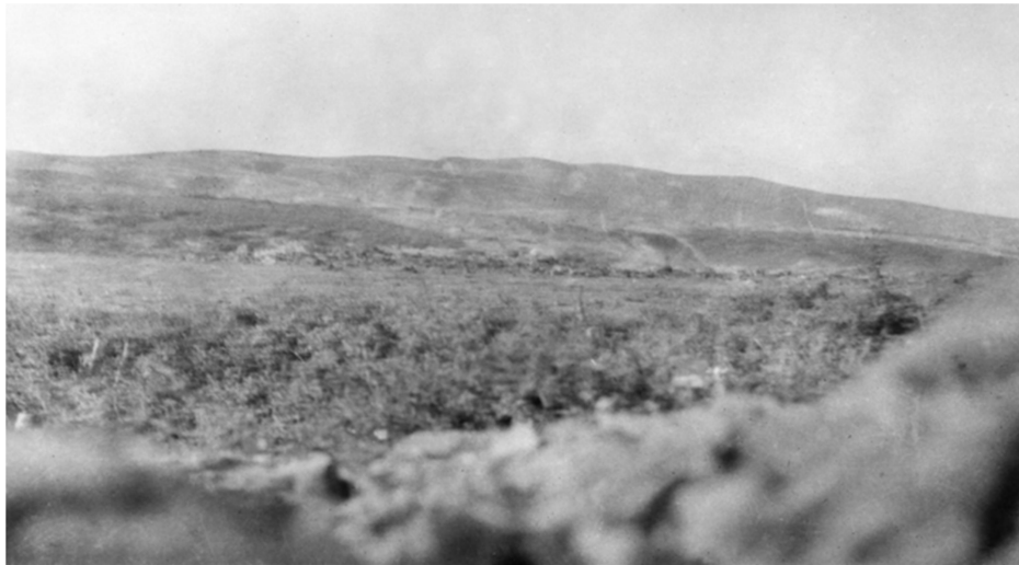
Image 6: View towards Lone Pine, 6 pm, 6 August 1915. Note the grass and shrubs in the foreground.