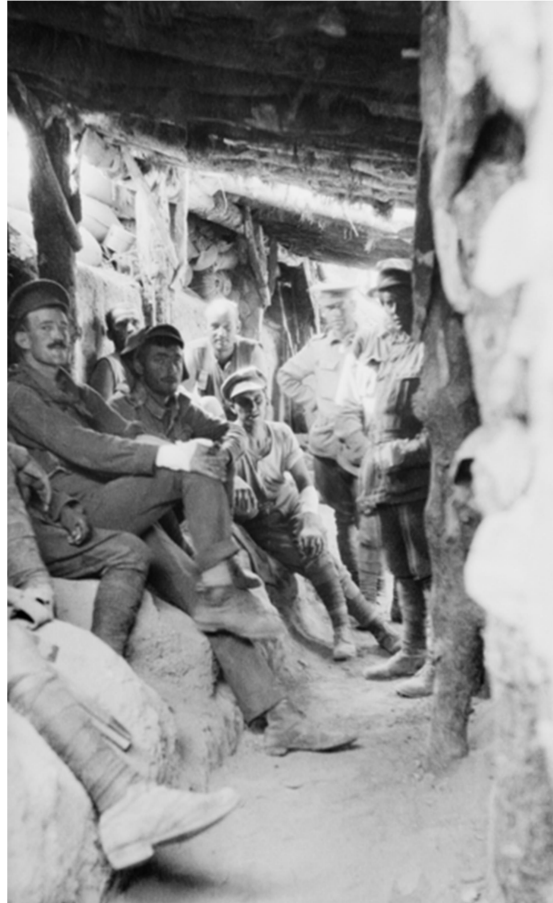
Image 9: Australians resting in a section of the Turkish front-line trench at Lone Pine. Note the overhead logs rising towards the front.

towards the rear [image 10]. Again, had Anderson incorporated the historically accurate design it would have obscured some figures. The model also suggests that a continuous line of logs existed across the entire Turkish front trench, which is incorrect. As popular memory has it that the Australians were confronted by pine logs, constructing gaps overhead would have probably distracted the viewer from the popular narrative as well as from the figures.