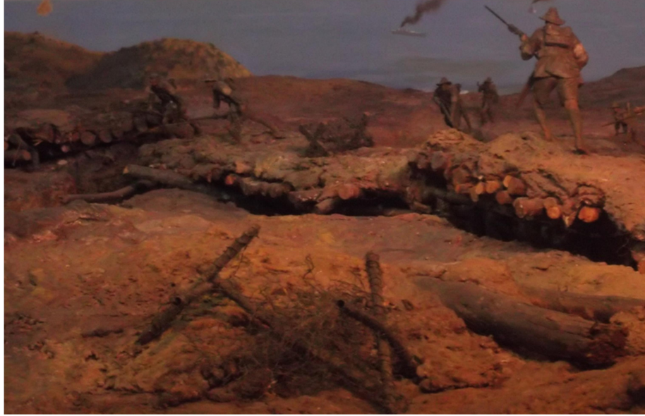
Image 5: A close-up of the model's base, showing a lack of vegetation.