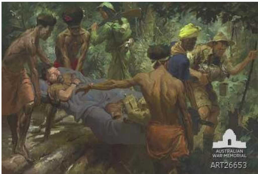
William Dargie, Stretcher bearers in the Owen Stanleys, 1943, oil on canvas, 143.2 x 234.4 cm.

The popular myth of the Fuzzy Wuzzy Angels has throughout the generations asserted the belief that Papuan carriers, during the 1942 battle for Kokoda, willingly provided assistance to the Australian war effort as volunteers. However, contradictions surround the history of the Papuan carriers concerning their recruitment, treatment, and working conditions. The contrasting stories of Papuan experiences as carriers have been left out of Australian memory for a number of reasons. This exclusion has in turn affected the way Papuans see their role as carriers in post-war history, and also raises issues of recognition, compensation and remembrance.