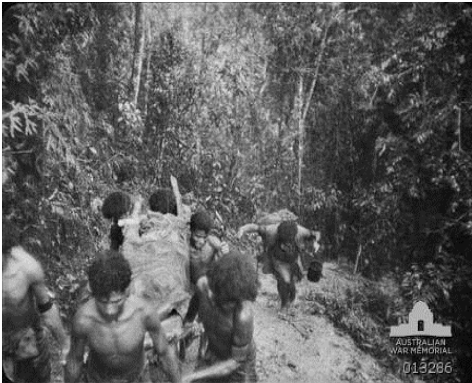
Image 3: Six Papuans carry a wounded soldier up a steep track through the rain while another carries supplies. (AWM013286)

Yet the belief that Papuans were loyal to Australians can be contested as evidence implies that in most cases the Papuans were not performing such laborious tasks from friendship or loyalty. Nor were they happy or willing to be doing so. Indeed, the assumption that the Fuzzy Wuzzy Angel were volunteers should be open to dispute as records of ANGAU illustrate they were in fact a conscripted labour force.