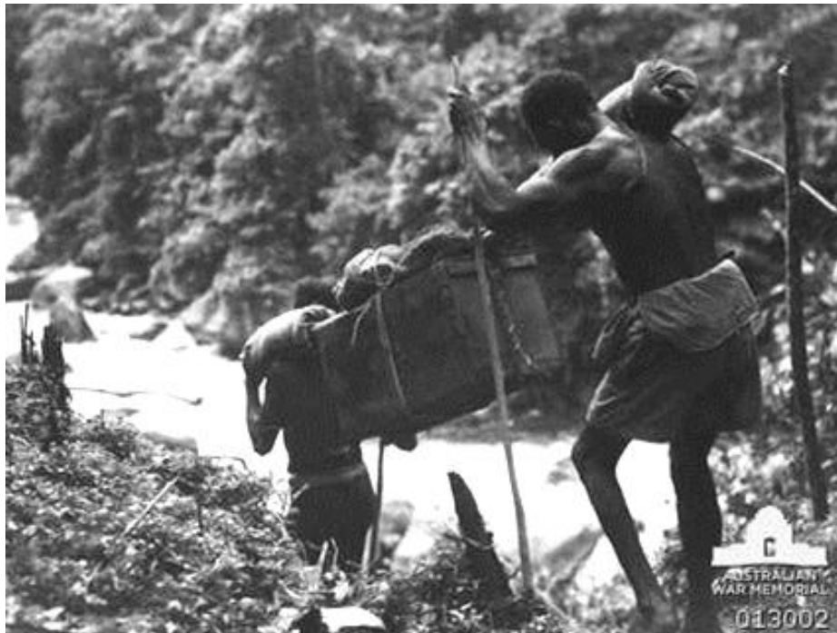
Image 4: Two Papuans carrying a heavy load of supplies. The pole is padded to protect their shoulders. (AWM 013002)

So how is one meant to remember the Papuan carriers in light of these contrasting stories that surround the myth of the Fuzzy Wuzzy Angels?